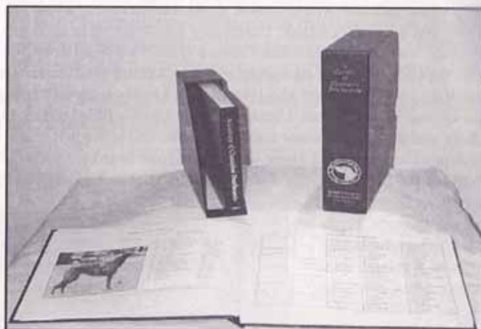
A CENTURY OF CHAMPION DEERHOUNDS

2 BOOKS BOXED AVAILABLE TO MEMBERS FOR £65 PLUS POSTAGE £95 NON MEMBERS CONTACT MICK PEACH 01773 820279 FOR DETAILS