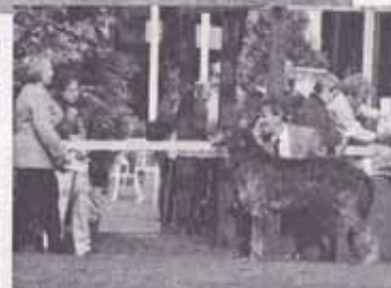
RESERVE BEST DOG CH SHIELHILL BRAN TO KILBOURNE (above)