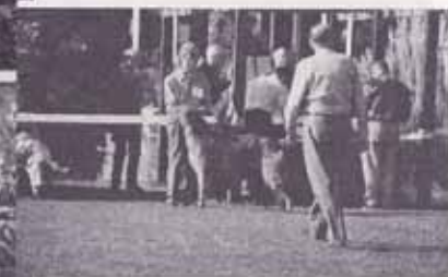
RESERVE BEST BITCH CH TERICHLINE RIPPLE(left)