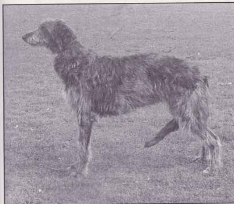
Pica G Peach on the day