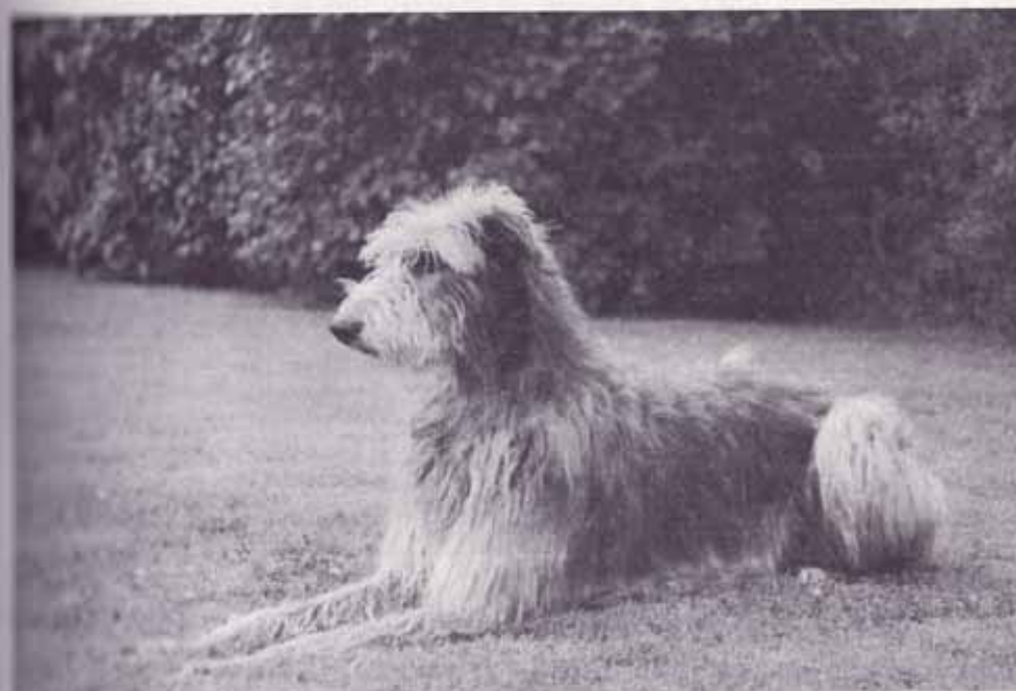
WATCHED BY HIS BEST FRIEND ACACIA SILVER JUBILEE FROM DFAULT