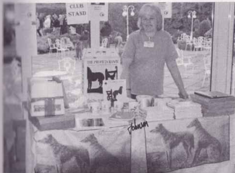
Club stand (top) Our overseas exhibitors (bottom)