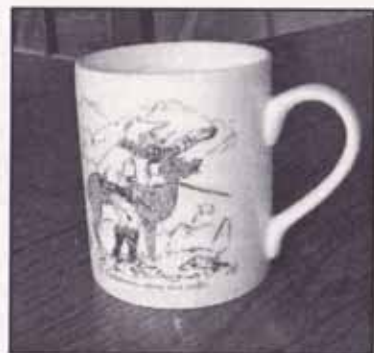
NEW PORCELAIN MUGS FOR 2003