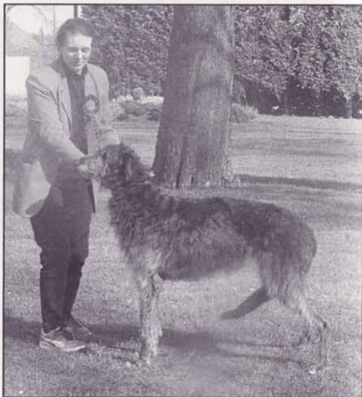
Pica G Peach –Scottish Breeds