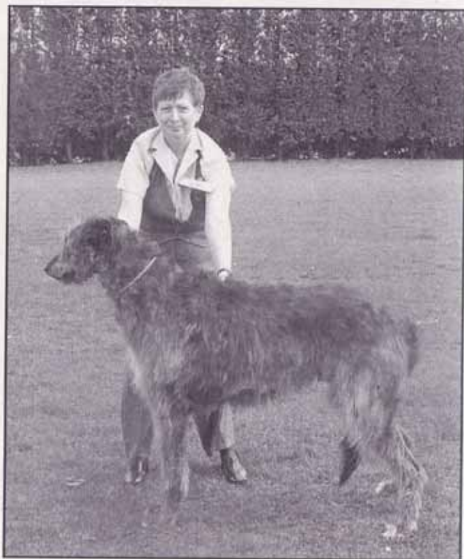
Pic G Peach on the day